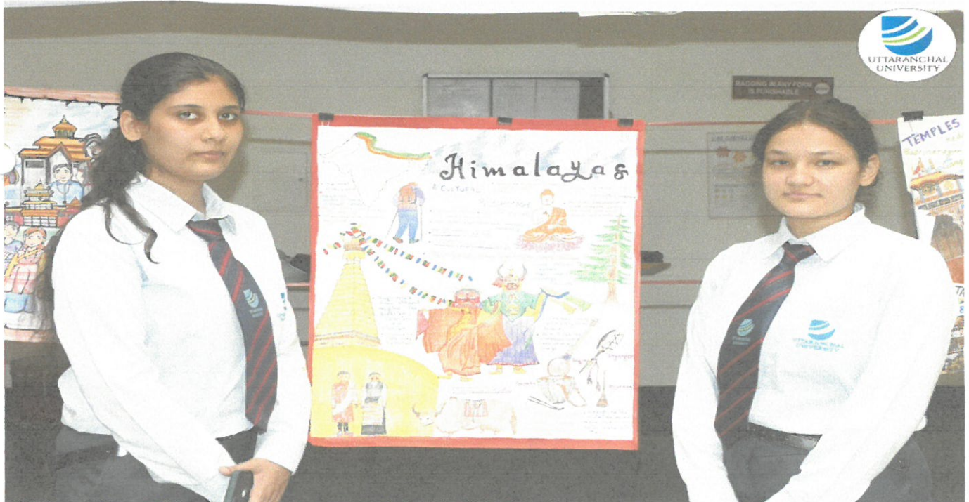
A poster Presentation Competition on the topic of 'Cultural Diversity of the Himalayas'